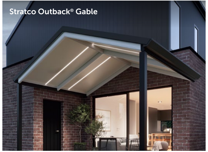
Stratco Outback® Gable