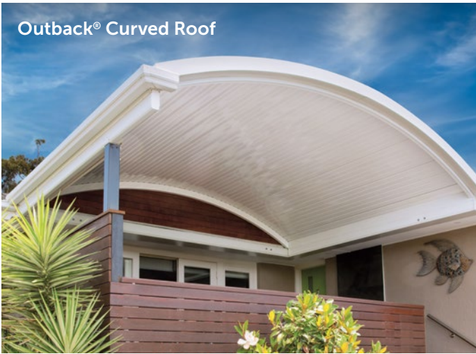
Outback® Curved Roof