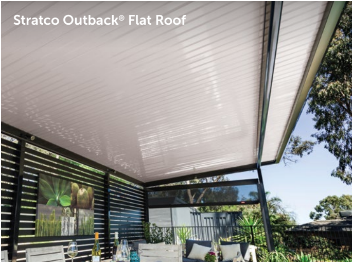
Stratco Outback® Flat Roof